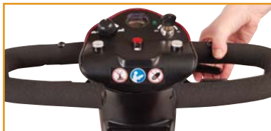
EZ Reach tiller adjustment