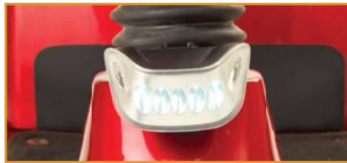
Angle adjustable LED headlight creates a wide path of bright light