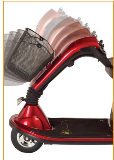
Patented infinite adjustable tiller